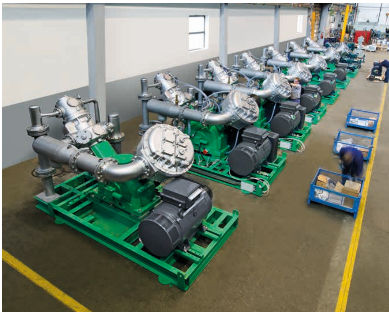
VITO: series production